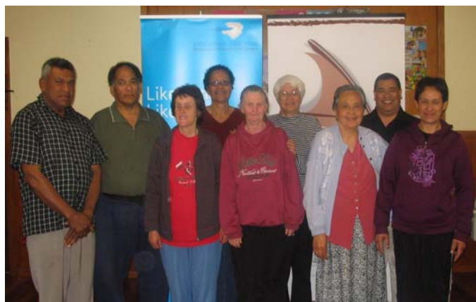
Below: Workshop held at Manurewa SDA Church with the Vaka Tautua Team

Positive feedback was received regarding both the format and delivery of the Like Minds, Like Mine workshop and the